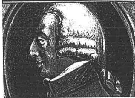
Adam Smith 1723–1790

In his book The Wealth of Nations , Smith argued that if individuals freely followed their own self-interest, the world would be an orderly and progressive place. Social harmony would result without any government direction, "as if by an invisible hand."