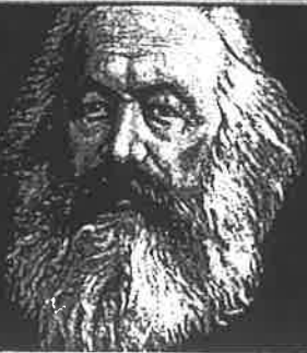
Karl Marx 1818–1883

Karl Marx studied philosophy at the University of Berlin before he turned to journalism and economics. In 1849, Marx joined the flood of radicals who fled continental Europe for England. He had declared in The Communist Manifesto that “the working men have no country.”