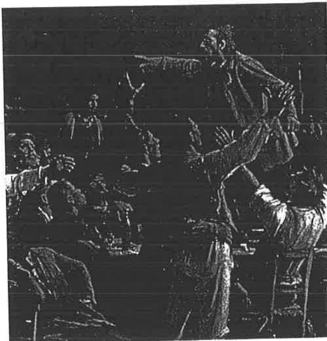
▲ Hungarian workers meet to plan their strategy before a strike.

In 1919, the U.S. Supreme Court objected to a federal child labor law, ruling that it interfered with states' rights to regulate labor. However, individual states were allowed to limit the working hours of women and, later, of men.