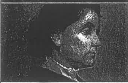
Jane Addams 1860–1935

After graduating from college, Jane Addams wondered what to do with her life.